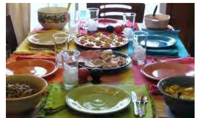
Could this be a hint?