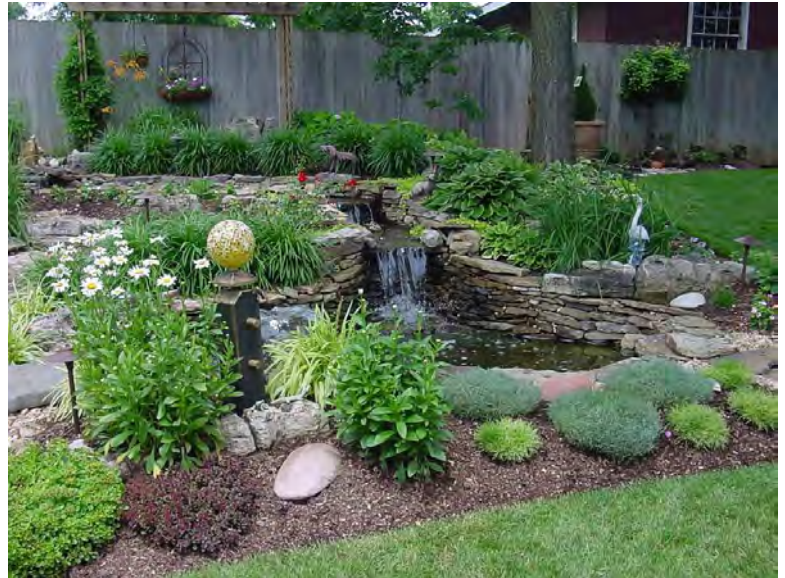
A pic taken during the 2008 pond tour at the Burtons.

Bill & Beverly Burton live in a patio home with a small backyard, but wait til you see it! It has a stream and pond with tiered beds and pathways and amazing rock work. They were on our 2008 public tour.