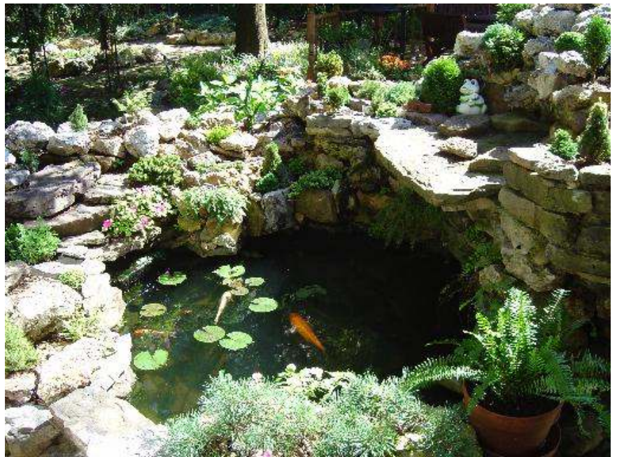
The Lovett's pond surrounded by miniature conifers

Mimi Grozinger 417-882-0528 Mi2grozinger@yahoo.com