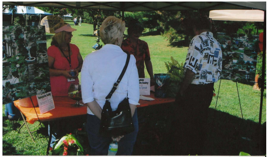
Another pic of our table at the Japanese Fall Festival