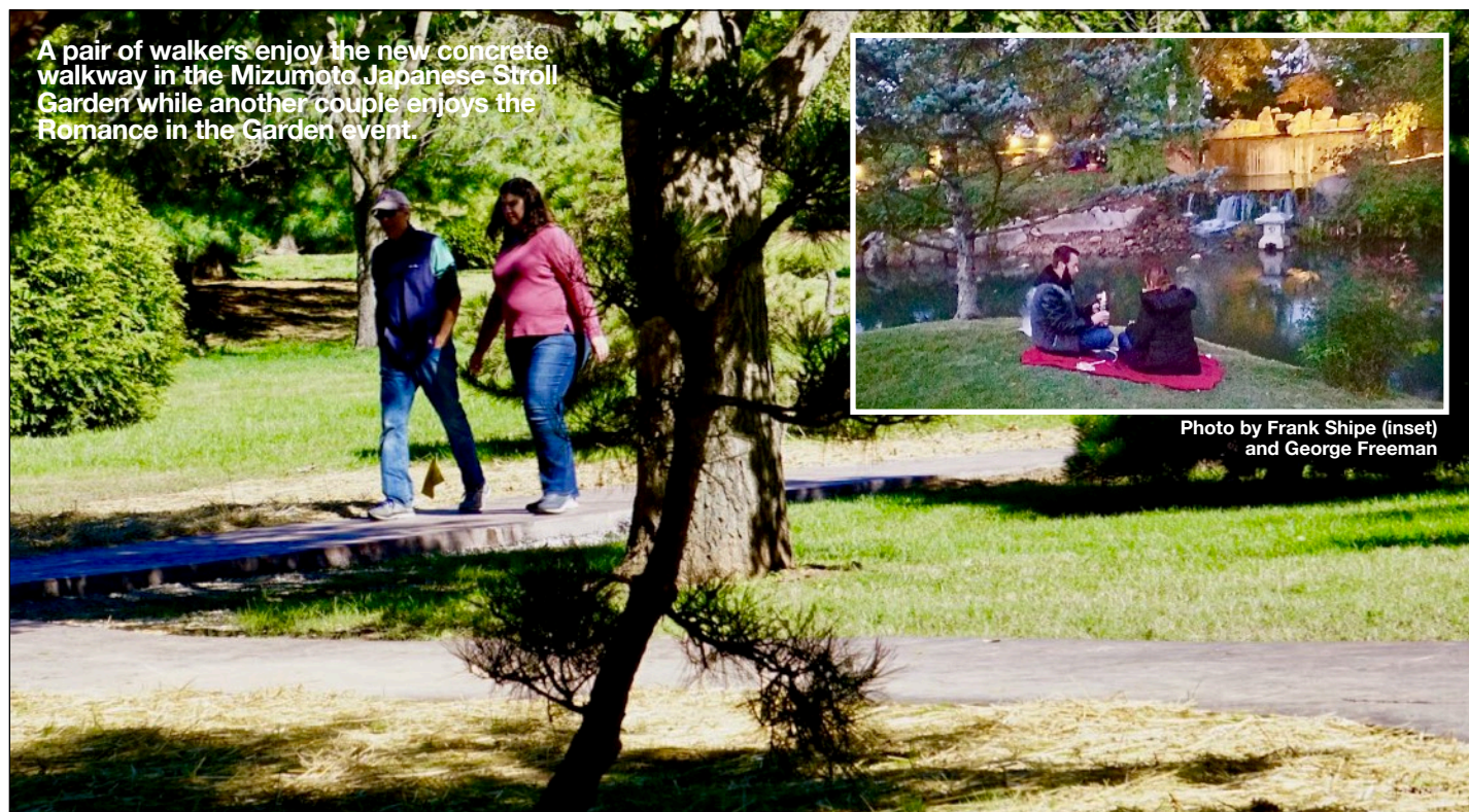
A pair of walkers enjoy the new concrete walkway in the Mizumoto Japanese Stroll Garden while another couple enjoys the Romance in the Garden event.