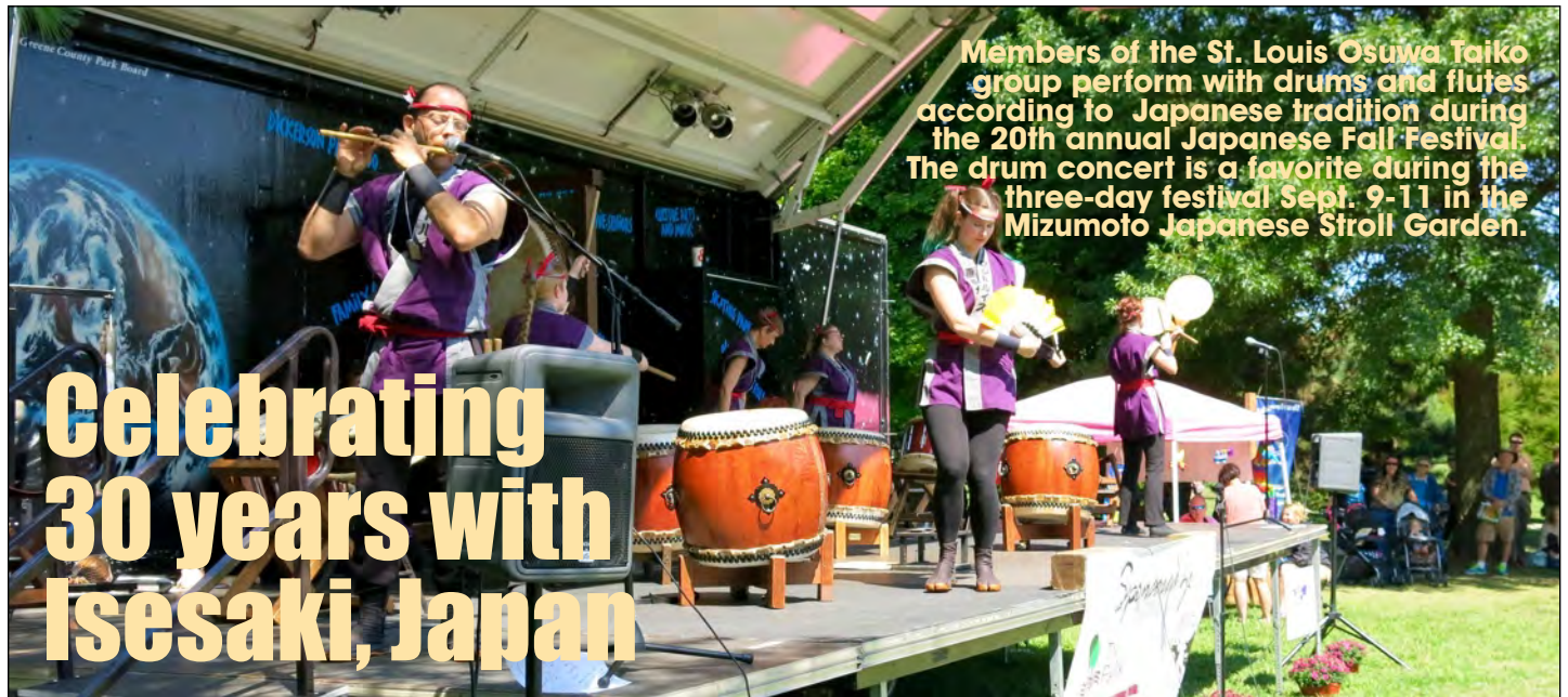
Members of the St. Louis Osuwa Taiko group perform with drums and flutes according to Japanese tradition during the 20th annual Japanese Fall Festival. The drum concert is a favorite during the three-day festival Sept. 9-11 in the Mizumoto Japanese Stroll Garden.