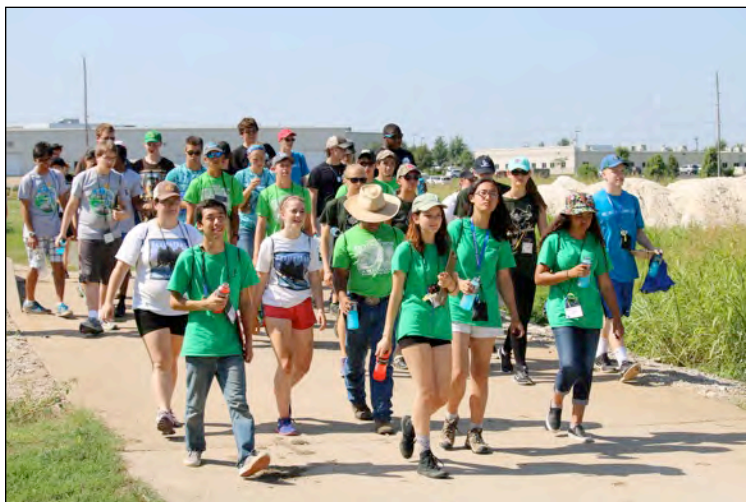
Above, participants in the Envirothon. The event brought students from 44 states and eight Canadian provinces. At right, young "pioneers" portray life in the 1860s during the Gray Campbell Farmstead 1860s Lifestyle Expo. More than 400,000 visitors visit the gardens each year.

This is a huge value having educators and researchers that take an interest in your wellbeing. Whether you tap the advice of the Master Gardeners to create a program for your civic group or ask them a question about what's going on in your garden; or if you participate in the number of different classes the Extension specialists offer, if we are going to have a