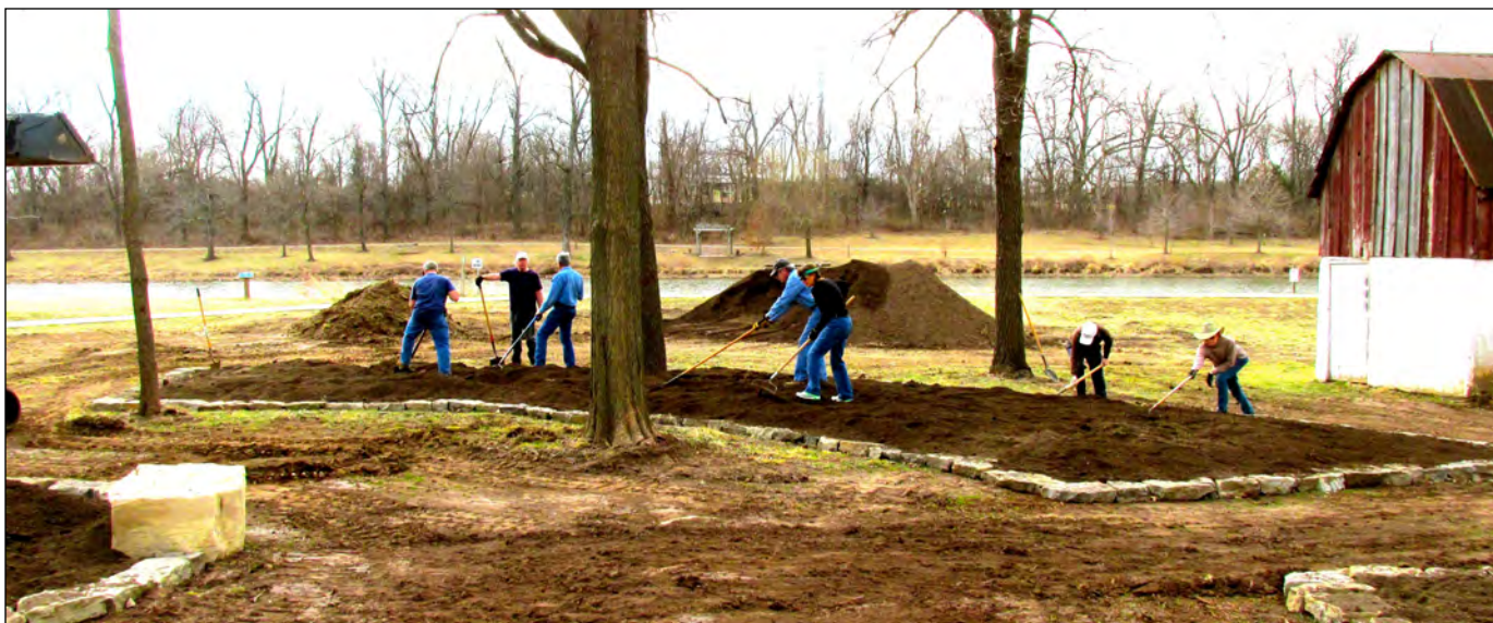
Volunteer gardeners from Friends of the Garden spread top soil in raised beds in the new founders garden.