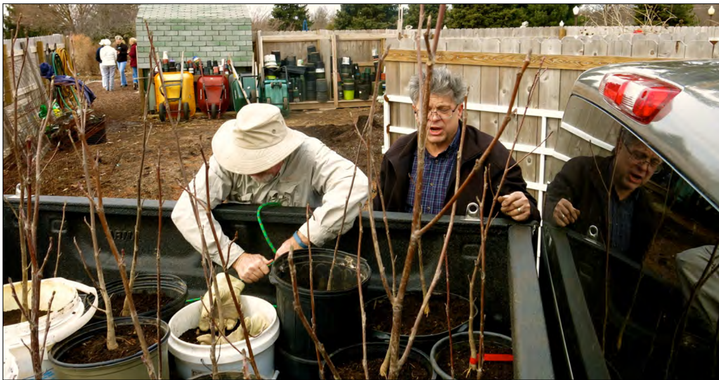
Master Gardener volunteers load newly potted seedlings in preparation for the annual plant sale on April 24.