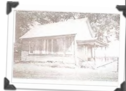
Photo of historic Liberty School at its original location near of Fellows Lake. At least $50,000 is needed to move the school to the botanical gardens.

"We hope to show them where education took place and instill in them an