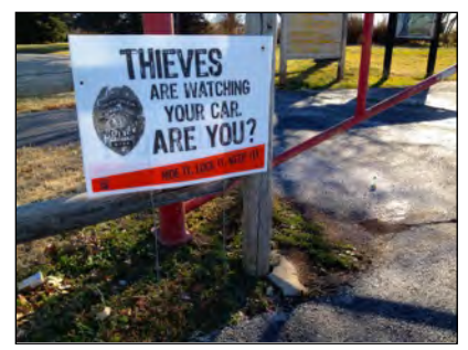
New signage warns park visitors to leave valuables at home or at least stow them in a locked trunk, away from 'smash-and-grab' thieves.

Thieves are more likely to break windows in a busy parking lot than when just a few cars are present, so special events are attractive. The botanical gardens aren't the only place where break-ins occur, but the proximity of some parking to tree lines offers easy cover and a quick getaway.