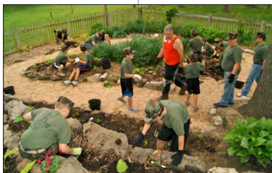
Young Marines at work in the Hosta Garden.