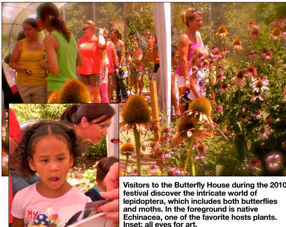
Visitors to the Butterfly House during the 2010 festival discover the intricate world of lepidoptera, which includes both butterflies and moths. In the foreground is native Echinacea, one of the favorite hosts plants. Inset: all eyes for art.

And did we forget to mention the Caterpillar Petting Zoo? Naaah, we just wanted to save the best for last, because if you have never petted a caterpillar, the kid in you is missing out.